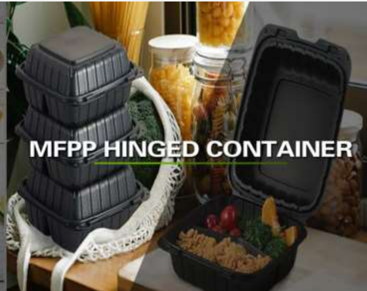
MFPP HINGED CONTAINER