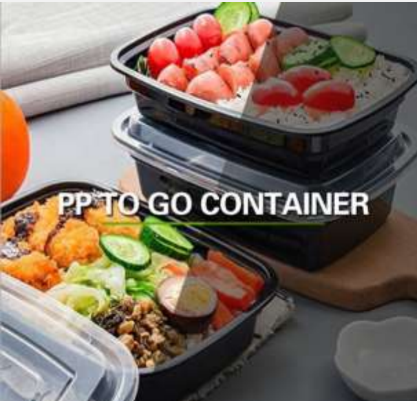
PP TO-GO CONTAINER

Your Disposable Food Packaging Solution Provider Since 2008