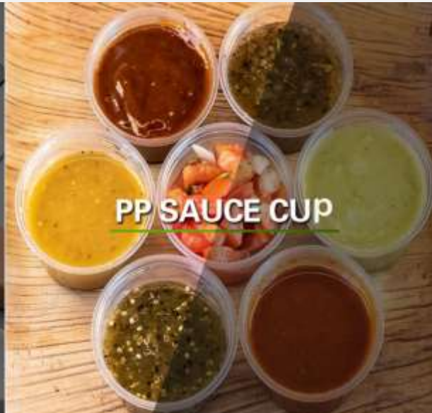
PP SAUCE CUP