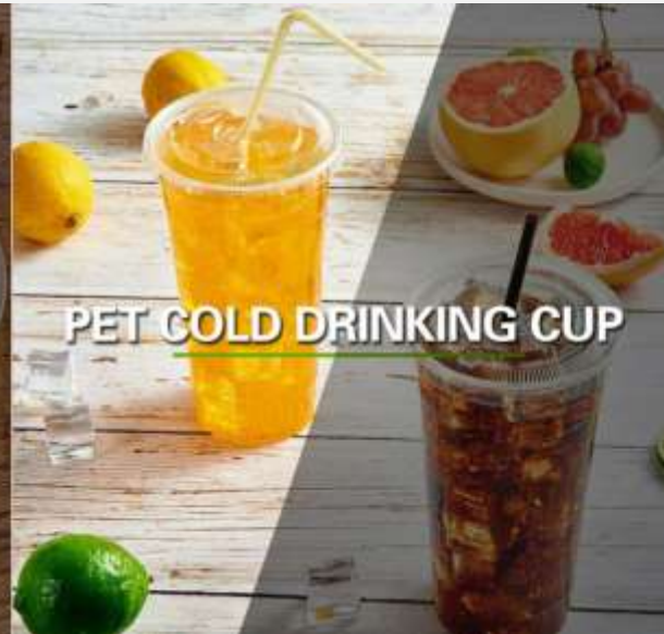
PET COLD DRINKING CUP